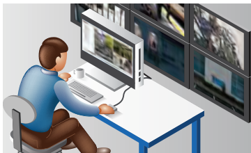
INTELLIGENT VIRTUAL MATRIX